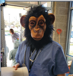
Just monkeying around!